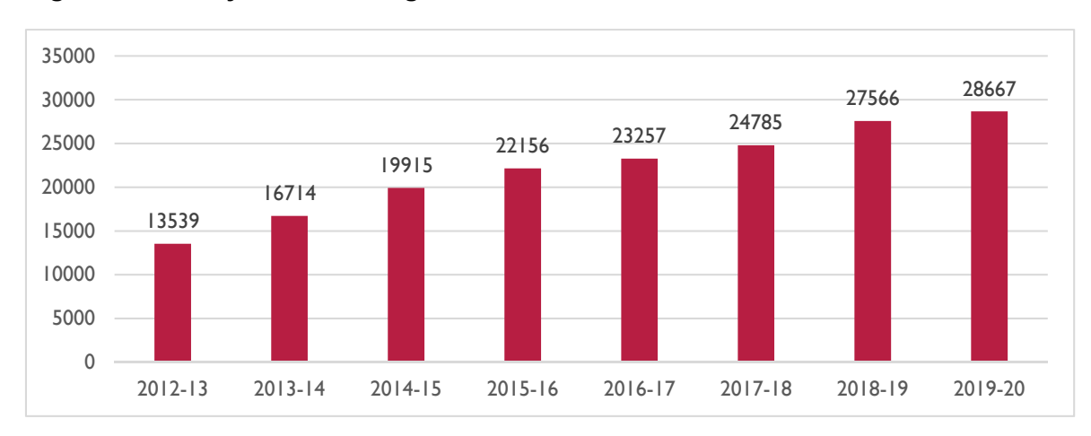
Figure 2 - Surrey GP Carer Registration Year on Year