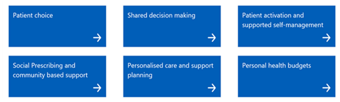
Figure 4 - Key elements of Personalised Care